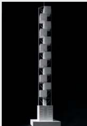
Climbing Torso , 1990 Thassos marble, chrome-plated steel 16 1/8 x 9 7/8 x 45 5/8 in (41 x 25 x 116 cm)